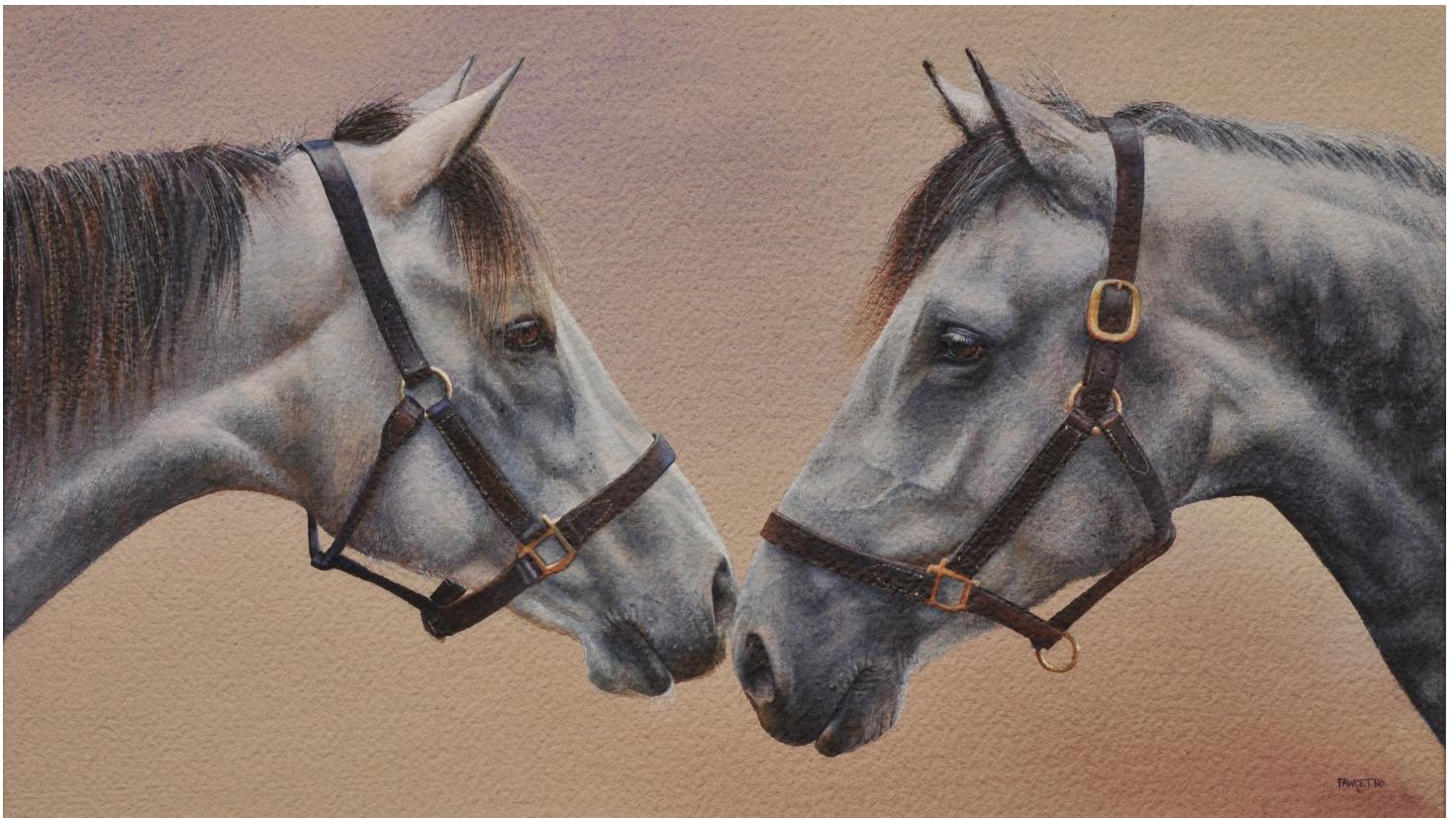
Two Champions 13 x 23 " Watercolor