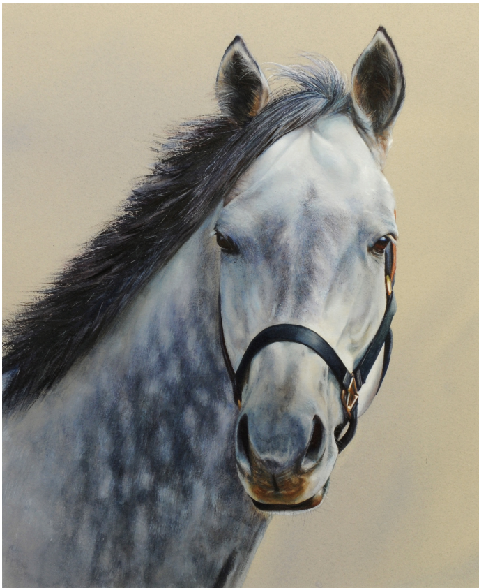
Forever Together 20 x 16 " Watercolor 2008 Eclipse Award Champion Female Turf Horse