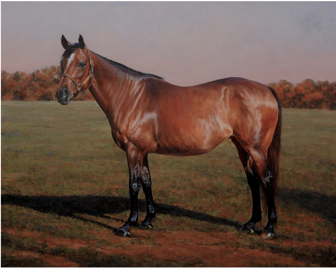
La Ville Rouge 24 x 30 " Oil