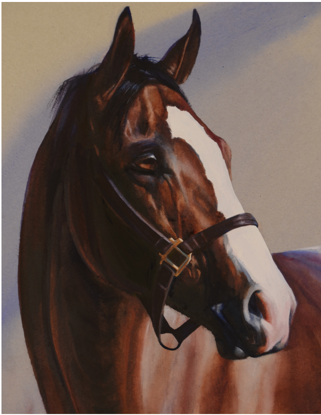
Union Rags 12 x 10 " Watercolor