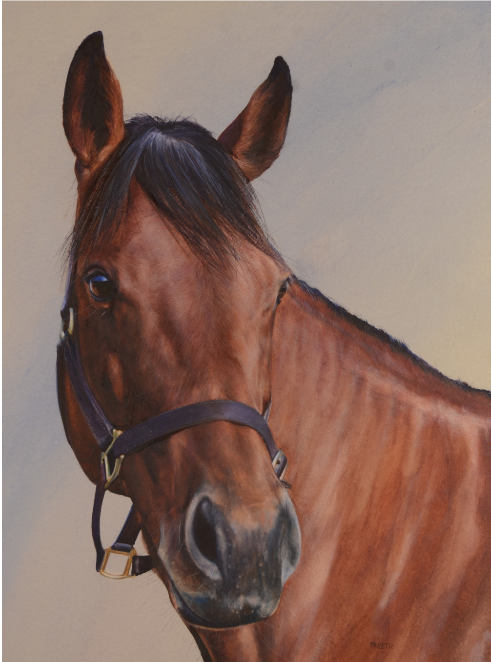
Moonlight Cloud 23 x 16 " Watercolor

" What a magnificent watercolor of Moonlight Cloud . You absolutely have captured not only her looks but her personality."