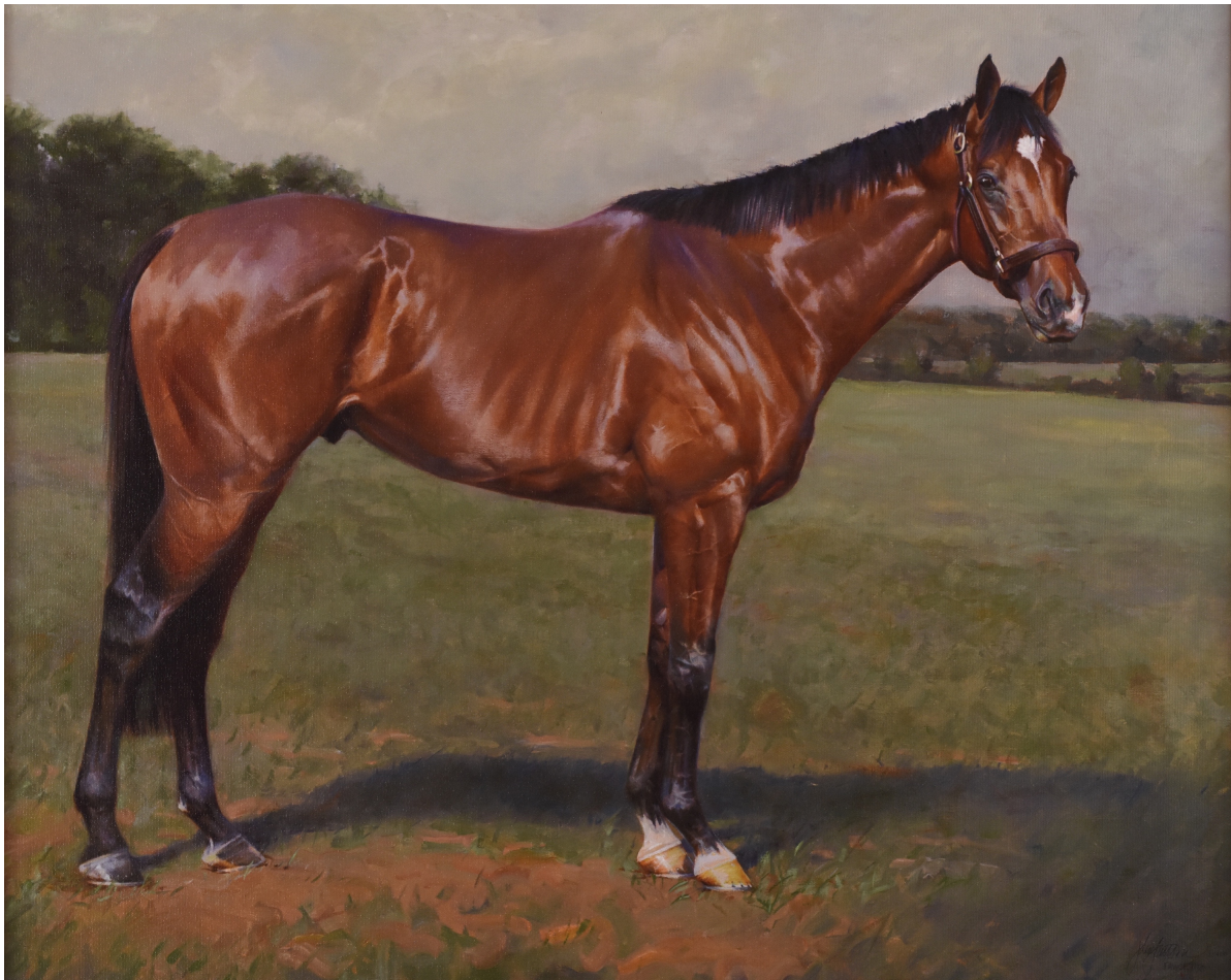
The Unbeaten Barbaro 24 x 30 " Oil 2006 Kentucky Derby Winner