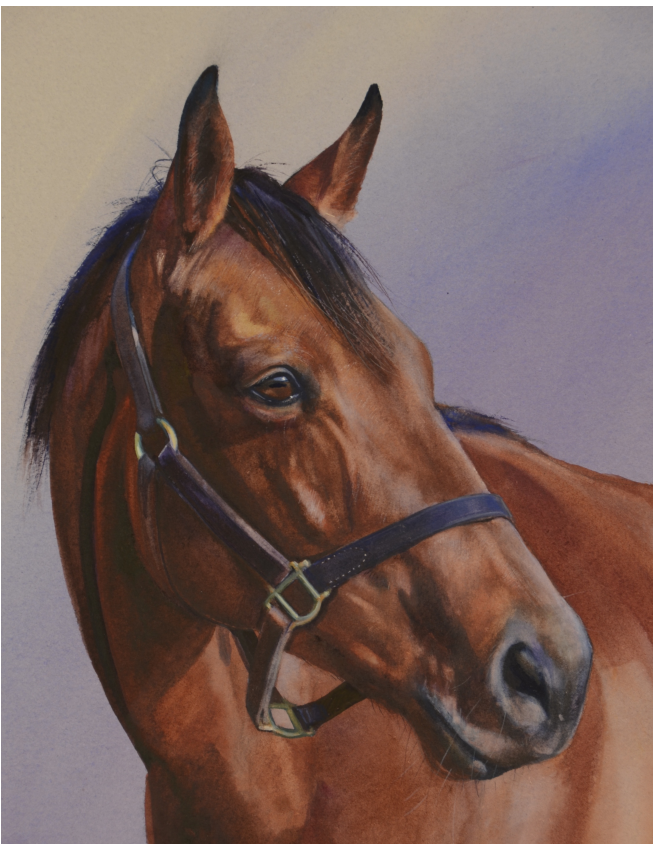
Moonlight Cloud-study 12 x 10 " Watercolor