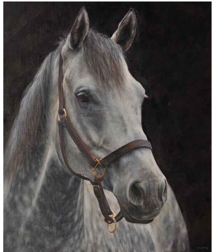
Informed Decision 24 x 20 " Oil 2009 Eclipse Award Champion Female Sprinter