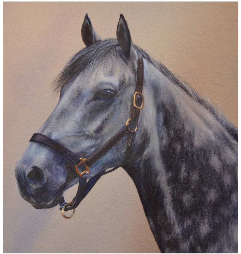
Informed Decision-study 12 x 10 " Watercolor