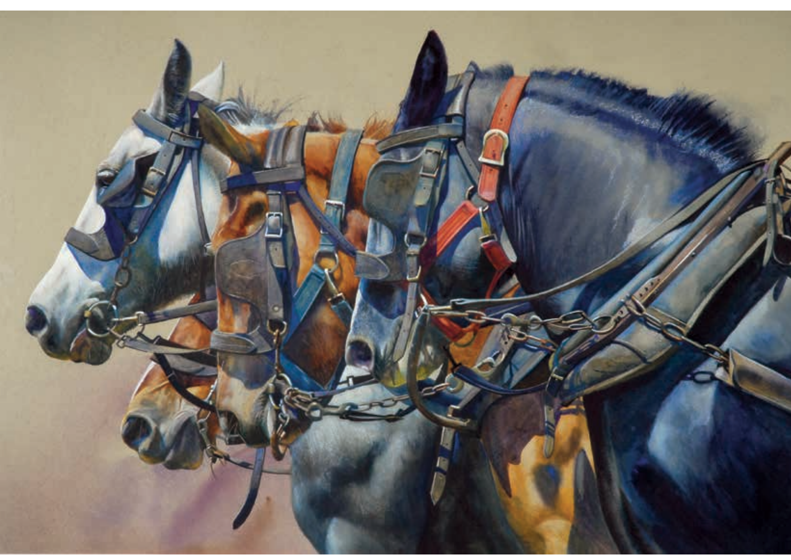
Four Horse Power, watercolor, 23 x 34". Loan: Courtesy of the artist.

museum first asked me to do this, I thought it meant I was dead or close to death. But now I'm realizing it's a chance to say thank you to so many people."